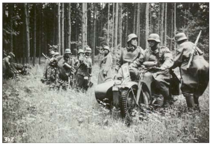
VICTORY CONDITIONS: The Germans win if there are no Soviet infantry south of the river at game's end. The Soviets win by avoiding the German victory conditions. BALANCE:

West bank of the Dneiper, near Stayki, Soviet Union, 25 September, 1943: The Soviet fall offensive was in full swing, Rybalko's 3rd Guards Tank Army had crossed the Dneiper at Bukrin, Moskalenko's 40th Army followed a few days later further upstream. One such crossing consisted of only 50 men who had crossed by swimming and improvised rafts. Knowing that such a bridgehead could be reinforced and expanded if left to itself, hastily motorized elements of 34th Infantry Division were ordered to "clear up the bridgehead and destroy the forces this side of the river..."